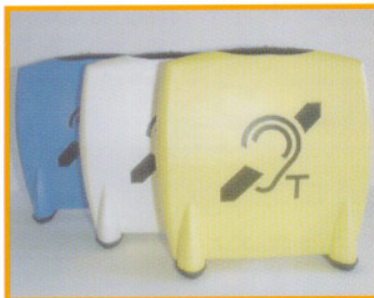
Portable Hearing Loops