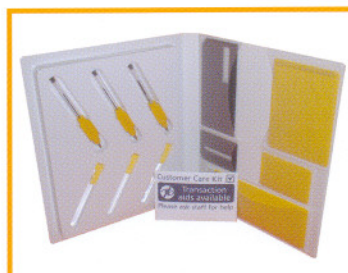
Customer care pack